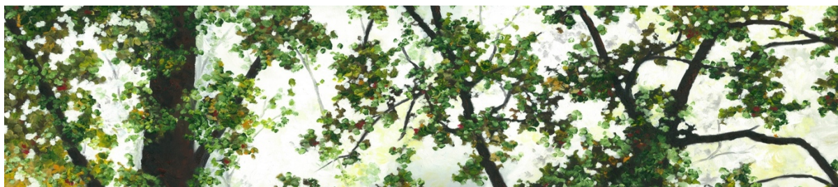
Walking in birches