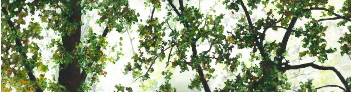
Walking in birches